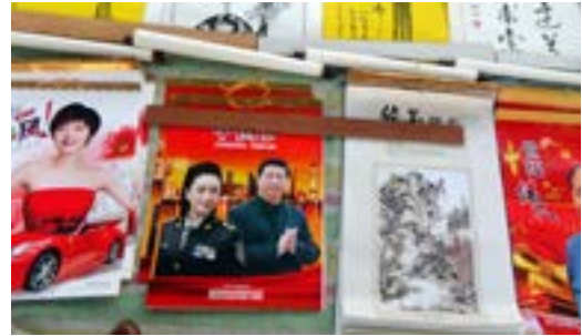
Hawker selling a "Chinese Dream" calendar.

Although Hong Kong's government was promised autonomy for 50 years, since Hong Kong's return to China, the Chinese government has exerted pressure on the Hong Kong government to pass bills that would expand the CCP's power in Hong Kong, encroaching on Hong Kong's citizens' freedoms. A pro-democracy movement was born