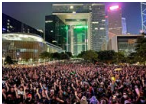
Crowds from the 2014 Umbrella Movement protests.