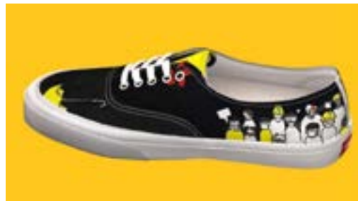
The removed Vans competition design.

During the same time as the Blizzard controversy, shoe and apparel line, Vans, faced a boycott in Hong Kong for pulling a sneaker design from its public design competition that depicted messages of the ongoing pro-democracy protests. It was unclear whether the Chinese government had reached out to Vans to request that the design be taken down, or if Vans was self-censoring. 39