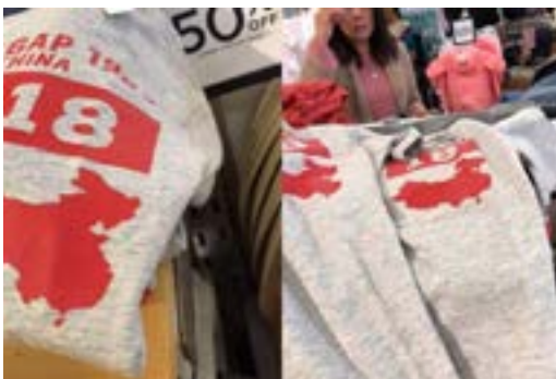
T-shirt sold by Gap.

Adhering to requirements from the Chinese government that companies doing business in China must refer to Taiwan as part of China, in 2018, hotel chains such as InterContinental and Marriott changed their designation of Taiwan to reflect it as a territory of China. 21 The Marriott chain in particular found itself in hot water after an online questionnaire listed Tibet, Taiwan, Hong Kong, and Macau separately from China. The Chinese government's Cyberspace Administration warned that the hotel chain "seriously violated national laws and hurt the feelings of the Chinese people." 22 Marriott promptly issued an apology and listed the regions as part of China.