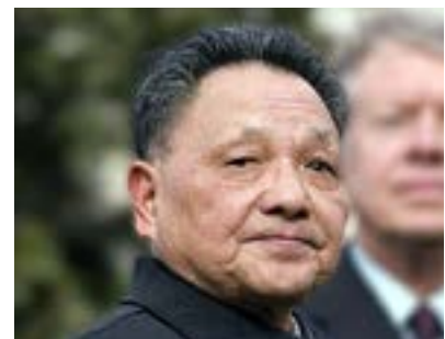
Deng Xiaoping