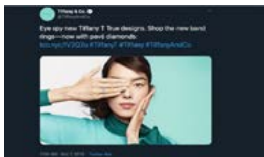
Tiffany’s ad which as since been deleted.

Like Apple, Google similarly censored an app relating to the Hong Kong protests. A game that was pro-democracy and based on the recent Hong Kong protests, “The Revolution of Our Times,” was removed from the Google Play store because it violated its “Sensitive Events policy,” according to an official Google email notification to the game developer. 41