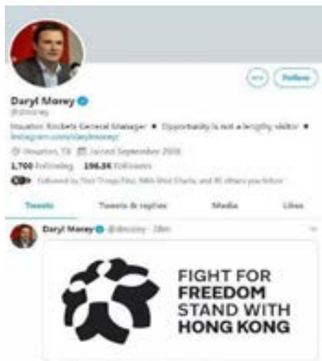
Daryl Morey’s tweet, which has since been erased.

State-owned television channels in China, along with Chinese media giant Tencent, followed by announcing that they would no longer broadcast games from the Rockets.