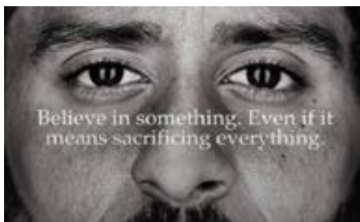
Nike’s “Dream Big” campaign.

Foreign companies that do business in China may find themselves caught between the liberal values that they were founded upon and authoritarian pressure from the Chinese government. To illustrate this conflict, one can look to U.S. companies that, in recent years, have increasingly taken positions in social debates. For instance, Nike’s “Dream Crazy” campaign in the U.S., featuring racial justice activist and former National Football League player Colin Kaepernick, won the company an Emmy for outstanding commercial. 46 Likewise, Gap has created campaigns in support of the LGBTQ community. 47 In the 2020 George Floyd protests that spread across the U.S., numerous companies, including many listed above, took a stand with African Americans who called for equality and police accountability.