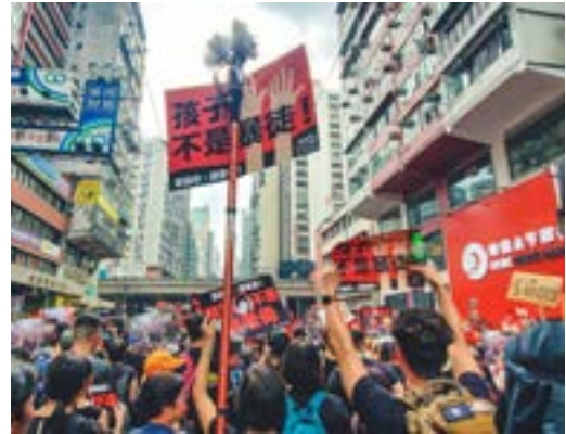
Around two million people protesting the extradition bill on June 16, 2019.

In the past, China relied on foreign investors to legitimize the country as a global trade competitor. However, as China has succeeded in demonstrating itself as a worthy competitor, the gov-