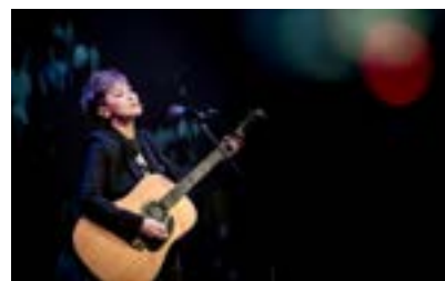
Denise Ho performing at the 2019 Oslo Freedom Forum

As part of its propaganda and information control, the Chinese government portrays the exiled Dalai Lama as a traitor-figure who advocated for the autonomy of Tibet. 17 The general public in China, unable to receive external information due to strict internet censorship, shares much of the same sentiment perpetrated by the Chinese government toward the Dalai Lama. Therefore, in 2018, when Mercedes-Benz posted an Instagram advertisement featuring a quote from the Dalai Lama, internet users in China responded angrily to the advertisement. The official CCP newspaper, People's Daily , doubled down, writing that Mercedes-Benz was the "enemy of the people," and that the advertisement challenged "the Chinese people." The company apologized for quoting the Dalai Lama and removed the advertisement citing "erroneous messaging." 18