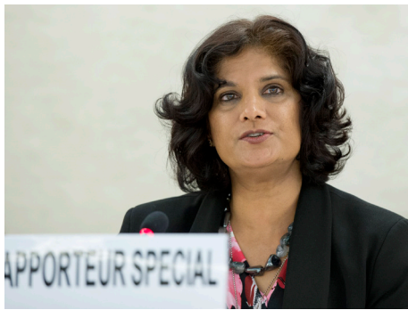
Urmila Bhoola, Special Rapporteur on contemporary forms of slavery, including its causes and consequences, during the 30th regular session at the Human Rights Council, 14 September 2015.