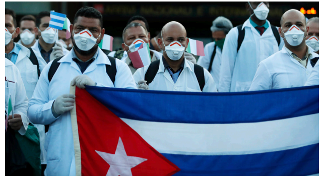
Medics and paramedics from Cuba pose upon arrival at the Malpensa airport of Milan, Italy, Sunday, March 22, 2020. Fifty-three doctors and paramedics from Cuba arrived in Milan to help with coronavirus treatment.

The pandemic has also allowed Cuba to revitalize its medical missions program and propa-