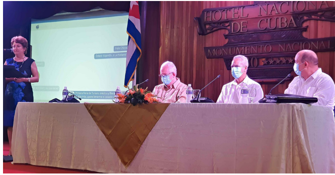
Announcement of the First International Fair of Medical and Wellness Tourism.

Honduras, Haiti, Niger, Rwanda, and Mali from the governments of Germany, France, Japan, Norway, and Australia. 138 During the 2014 Ebola epidemic, WHO financed Cuba’s medical missions to Liberia and Sierra Leone. 139 From 2013 to 2018, PAHO charged a 5% fee to serve as an intermediary for Brazil’s Mais Medicos program, an agreement that earned Cuba $400 million per year. 140