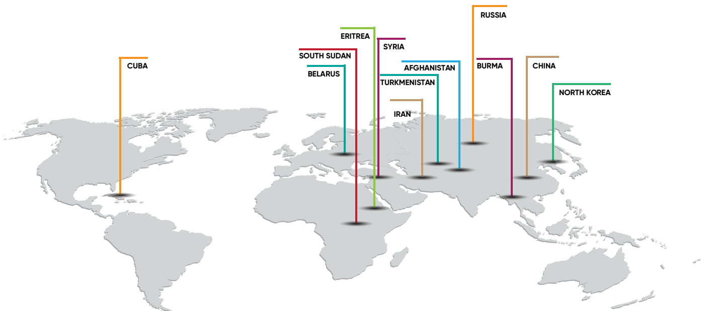
Governments with a “policy or pattern” of human trafficking according to the 2020 TIP

In 2019, the U.S. Congress amended the TVPA to note that governments can show a “policy or pattern” of human trafficking. This amendment recognizes state-sponsored human trafficking in government-funded programs, specifically forced labor in government-affiliated medical services such as Cuba’s medical missions. 38 Although the TVPA already considers whether government officials “participated in, facilitated, condoned, or were otherwise complicit in trafficking” when deciding tier rankings, the 2019 amendment directly connects government-sponsored human trafficking to a Tier 3 ranking. 39 In fact, the 2020 TIP Report marked the first time the U.S. Department of State applied this new legal provision, finding that the following governments had a “policy or pattern” of human trafficking: Afghanistan, Belarus, Burma, China, Cuba, Eritrea, Iran, North Korea, Russia, South Sudan, Syria, and Turkmenistan. 40 The 2021 TIP Report equally determined that all previous states (except Belarus) have an ongoing documented “policy or pattern” of human trafficking, trafficking in government-funded programs, forced labor in government-affiliated medical services, sexual slavery, or the recruitment of child soldiers. 41