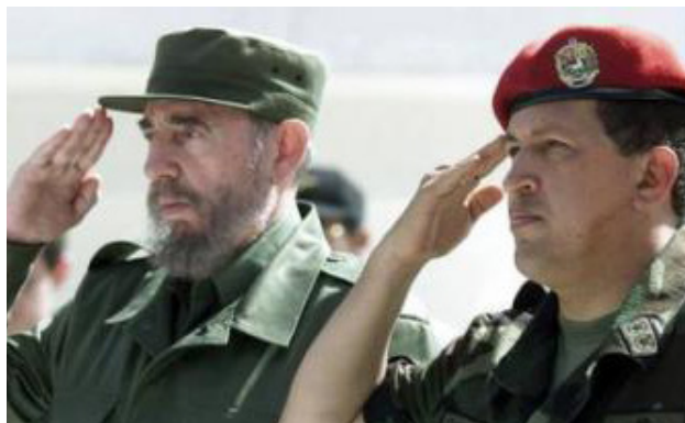
Fidel Castro and Hugo Chavez

The Cuban government's efforts to expand its medical missions program continued throughout the mid-2000s through structural changes in the island's healthcare system. In 2010, the Ministry of Health announced a personnel reduction in the domestic healthcare sector so that more doctors could be sent abroad "to earn hard currency." 62