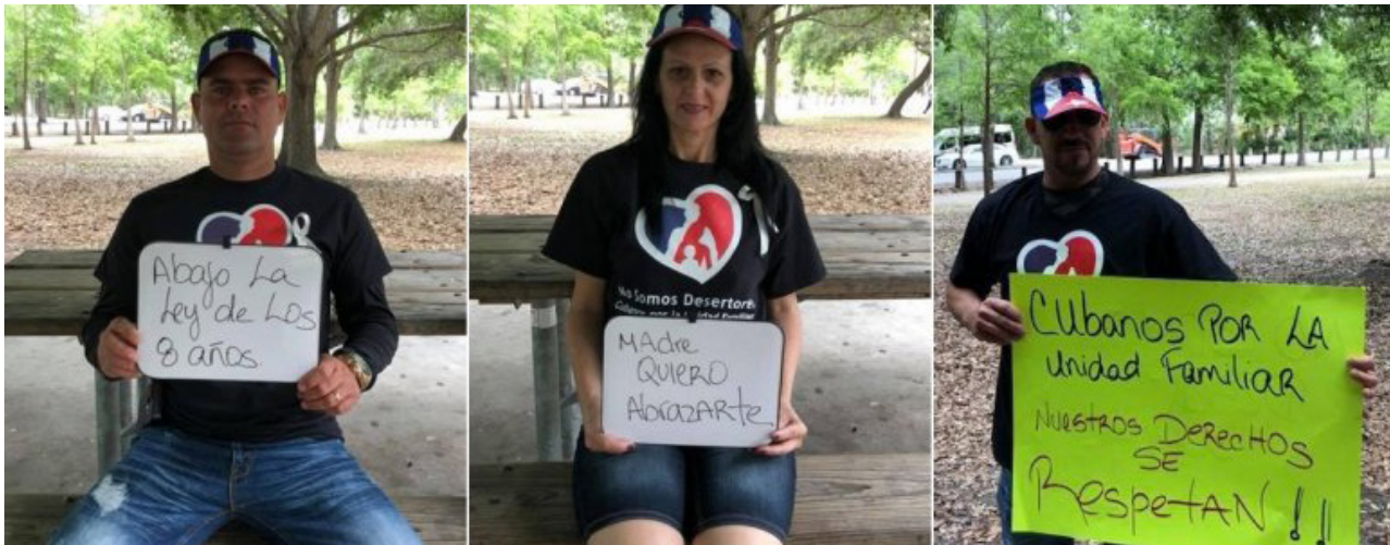
No Somos Desertores supporters holding up signs of the 8 year ban. "Médicos cubanos exigen que se les permita viajar a la Isla"

It is important to note that it is an accepted principle of international law that treaties apply to all individuals within a state's jurisdiction, including non-citizens. 111 As such, we can argue that host countries also have human rights obligations to all individuals living in their territory, including Cuban medical workers. The International Covenant on Civil and Political Rights (ICCPR), 112 which most host countries have ratified, protects the rights to freedom of expression and association, liberty, and movement. The International Covenant on Economic and Social Rights (ICESCR), 113 which recognizes the right to just and favorable conditions of work and to an adequate standard of living, enjoys almost universal ratification. Equally important, the Universal Declaration of Human Rights 114 contains freedom of speech and movement protections, including the right of all individuals "to leave any country" and to return to their birth country. As a result, host countries have an international law obligation to prohibit Resolution No. 168 from taking place in their territories, ensuring effective anti-trafficking and human rights protections for Cuban doctors.