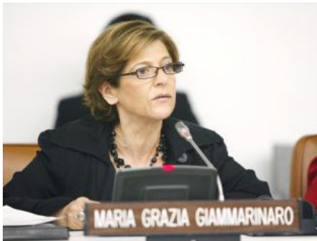
Maria Grazia Giammarinaro, Special Rapporteur on trafficking in persons, especially in women and children.

In the case of Cuba, intergovernmental organizations and foreign governments have denounced state-sponsored human trafficking in Cuba's medical missions. For instance, in the 2018 UN Universal Periodic Review of Cuba, the U.K. recommended the island to "[c]riminalize all forms of human trafficking [...] and address coercive elements of Cuban labour practices and foreign medical missions." 42 In September 2019, the U.S. Department of State announced visa restrictions on Cuban officials engaged in "exploitative and coercive labor practices" in the medical missions program. 43 Also, in November 2019, Ms. Urmila Bhoola (UN Special Rapporteur on contemporary forms of slavery, including its causes and consequences) and Ms. Maria Grazia Giammarinaro (UN Special Rapporteur on trafficking in persons, especially in women and children) sent a letter to the Cuban government, stating that the working conditions reported to them "from first-hand sources" could amount to forced labor. 44 Moreover, the 2021 TIP Report found that there is a "government policy or government pattern" in Cuba to profit from labor export programs with strong indications of forced labor, particularly in Cuba's medical missions. 45