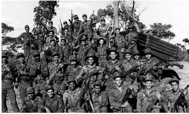
Cuban soldiers in Angola.

Cuba's brand of "medical internationalism" began in the 1960s with Cuba sending doctors to Algeria during its war with France. 57 Between 1966 and 1974, Cuba expanded its nascent medical missions program and sent doctors to work in Guinea-Bissau in support of its liberation struggle against Portugal. When Guinean President Amílcar Cabral requested Cuban assistance, the island sent a small military contingent to the region, along with a 31-member medical brigade. 58 In 1975, Cuba embarked on its largest military campaign in Africa, sending combat troops to Angola in support of the communist-aligned People's Movement for the Liberation of Angola and providing doctors alongside its military aid. 59